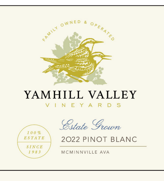
Ample mouthfeel, toasted coconut, hazelnut, lemon curd, nectarine, white peach blossom.